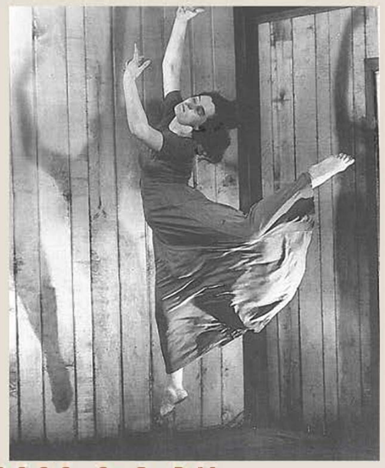
OCTOBER 30, 2022 2-3 PM ST. ELIZABETH OF HUNGARY CATHOLIC CHURCH 9016 BUCKEYE ROAD